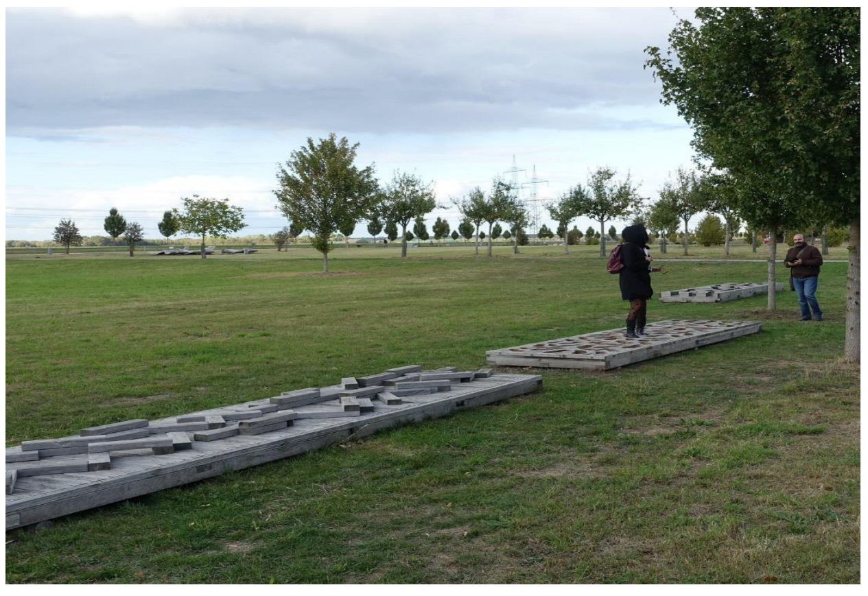
Nordpark Pulheim.

Sustainable planning in peri-urban areas requires strong stakeholder engagement in order to move from the 'not in my backyard' attitude to a more productive cooperation. An integrated approach is needed to achieve development objectives with focus on environmental protection, the provision of ecosystem services, the creation of green infrastructure alongside local economic development, and the maintenance of quality of life. A successful example in tackling these challenges, identified by <u>U2L2</u> project, is the <u>Nordpark Pulheim</u>. The inner-city green areas in Pulheim (DE) were not sufficient to meet the citizens' needs for green areas. The city authorities launched an initiative aiming to transform an area between the city and the adjacent farmlands into a park. A new urban landscape with field paths, tree-lined avenues and parcelled fields was implemented offering new use forms for the citizens while enhancing biodiversity. This innovative idea, its participatory approach in the planning process, its results and lessons serve as a model for other cities.