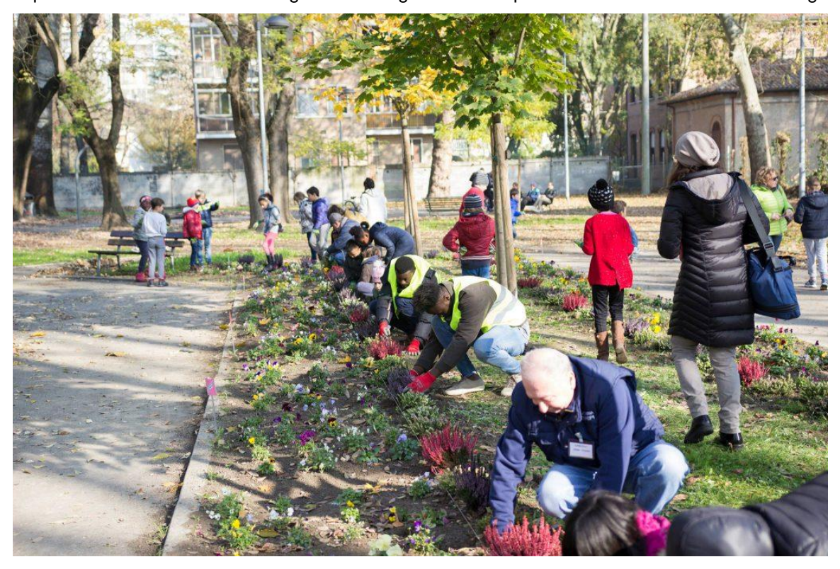
Urban garden in Ferrara.

There are great varieties of urban agriculture, like community gardens, allotments, backyard gardens, rooftop gardens, vertical gardens, urban farms or city farms or the so-called ZFarming (zero-acreage farming) <sup>20</sup>. As a new use form of urban landscape, urban gardens are more appealing and useful when they are well planned and designed. For example, the city of Ferrara (Italy), a partner in <u>PERFECT</u> project, developed a <u>regulation</u> for participatory management of public green areas to improve the maintenance and foster community integration. The initiative brought positive outcomes related to the improvement of common kitchen gardens and green urban spaces and contributed to social integration.