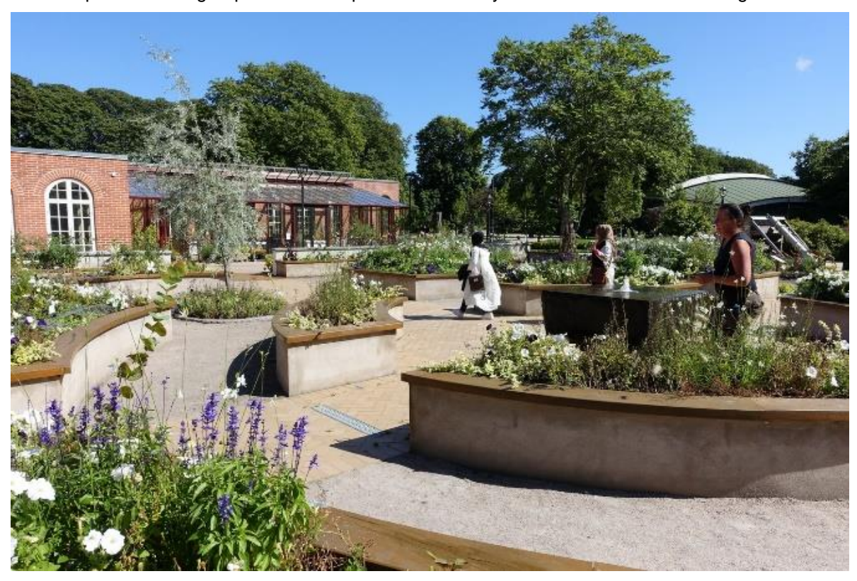
The healing garden of Kristianstad.

There are just a few examples of healing gardens <sup>21</sup> in public parks in Europe. One of these is located in the inner-city park of the Swedish city of Kristianstad and has been identified as a <u>good practice</u> by <u>UL2L</u> project. The construction of the healing garden was initiated by the municipality with the aim to include special needs groups in a health preventive activity and increase their well-being.